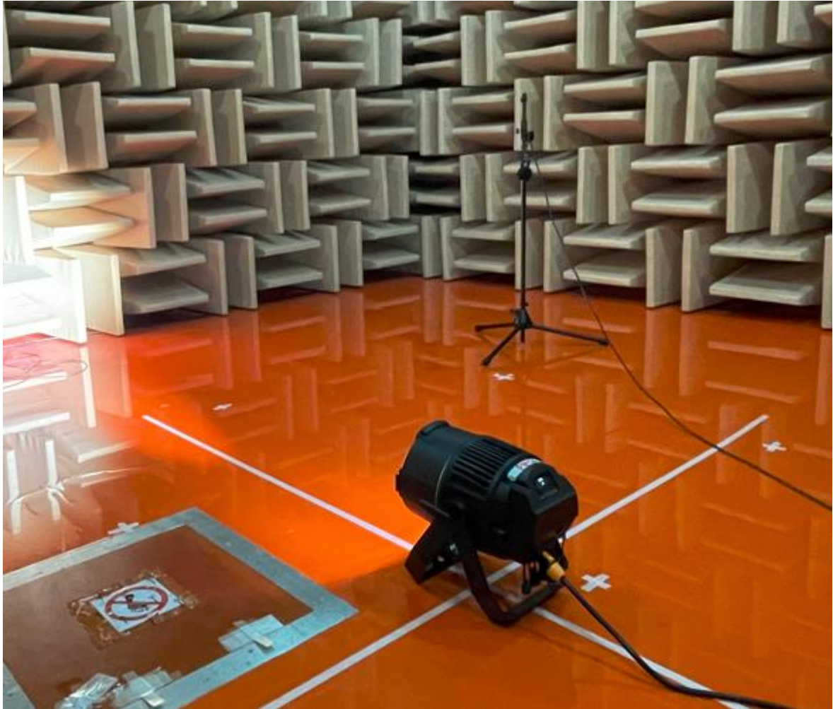
Figure 1: Test setup

The product was placed indoors in a semi-anechoic room in the internal Lab of Harman Technology in Shenzhen, China (See Figure 1). The ceiling and walls were all acoustically absorbent, and the floor was reflective. The main dimensions of the room were 5.9m * 4.9m * 3.3m (length * width * height).